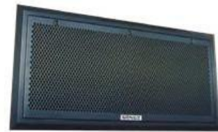
Air Return Grille