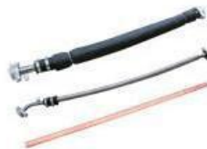
Pipe and Hose